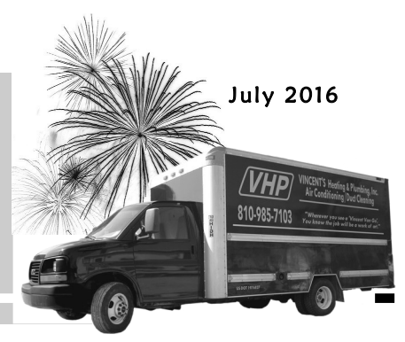
"Wherever you see a Vincent's Van Go' you know the job will be a work of art."